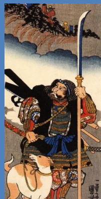
A samurai holding a naginata