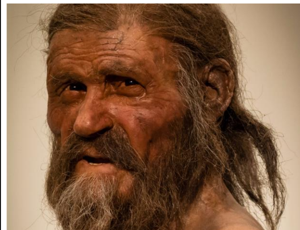
A reconstruction of Otzi's face

Since he was found, scientists have analyzed 16 his clothes, his skin, and even the tattoos on his skin, but they hadn't found his stomach. The reason for that was because as his body mummified 17 , his stomach was pushed up under his ribs. No scientist thought to look there. Until, a few weeks ago. And, what did they find? Otzi's last meal had a very high fat content. His stomach was 40% full of fat. Sounds like my stomach!