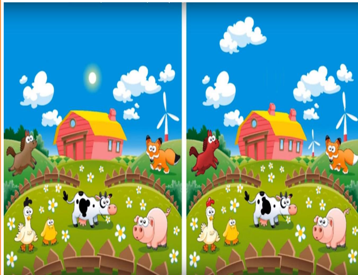
Spot the difference – 13 differences