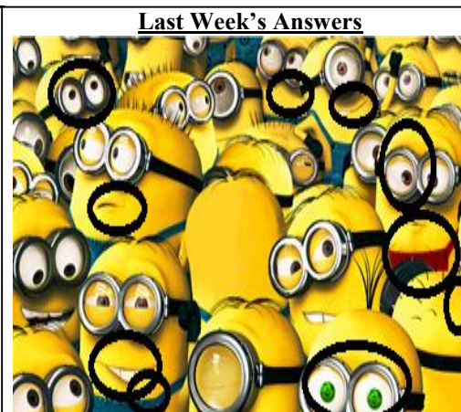
Last Week's Answers