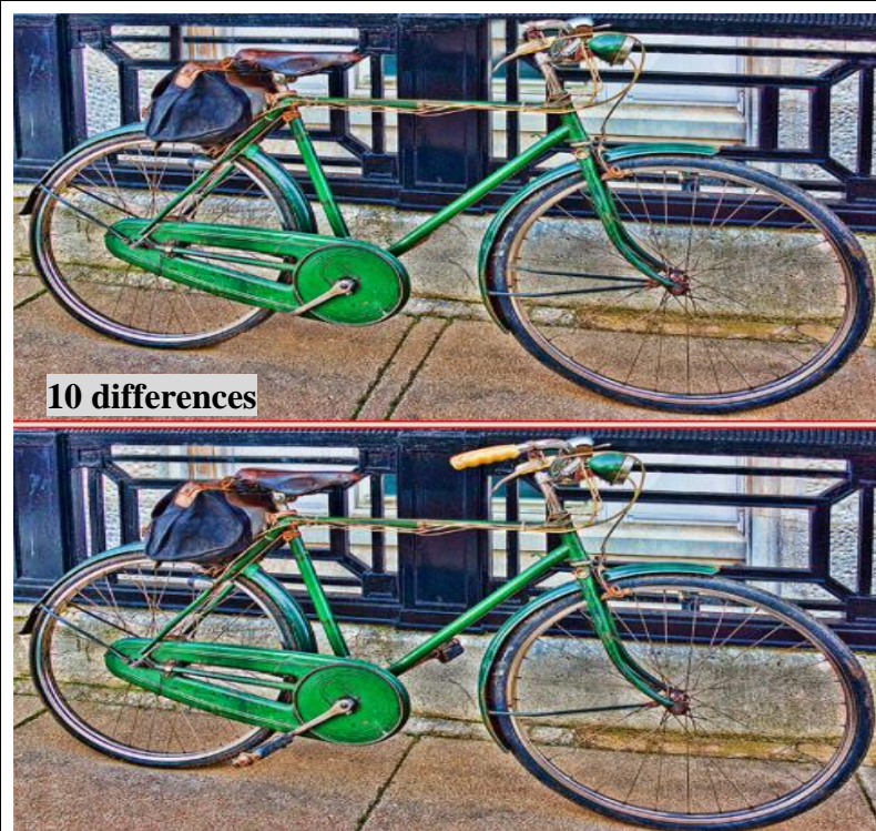
Last Week's Answers