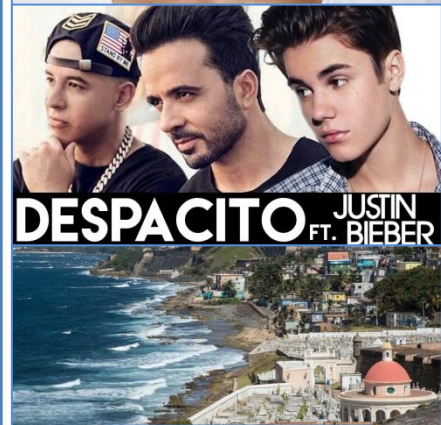
San Juan, Puerto Rico