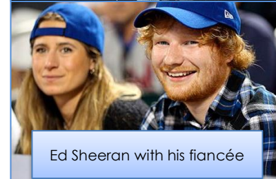
Ed Sheeran with his fiancée