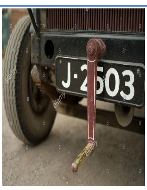
A gasoline car handcrank

(Gasoline cars had to be started with a handcrank on the front of the car.) They were cheaper than gasoline cars. However, by 1920, this had changed. There were two reasons for this. Firstly, gasoline cars had overcome all of their problems. They had batteries to start instantly. They had mufflers to reduce<sup>11</sup> the noise and smell. Gasoline became cheaper. Secondly, the road networks in many countries were increasing. Electric cars only had a short range. That meant they were great in cities, but not for long distances. As people started to drive farther and farther, they needed to use gasoline cars. Until 2021. I hope.