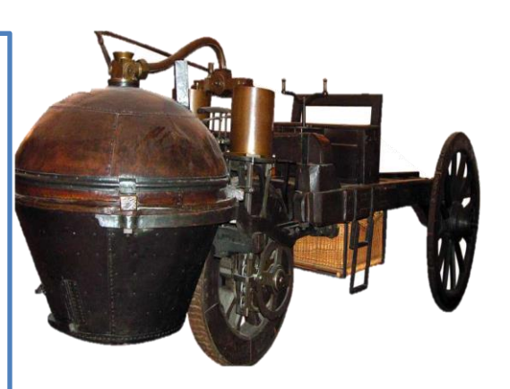
A steam car

In 1859, the rechargeable battery was invented and soon after that the first electric car was invented. As we know that there are more gasoline cars than electric cars now, we would be forgiven for thinking<sup>7</sup> that the gasoline car soon outsold<sup>8</sup> the electric car. This is not true. By 1910, in New York, 70% of all cars were electric. Why? They were quiet and they didn't smell like gasoline cars. They did not use gears<sup>9</sup>. They started instantly<sup>10</sup>.