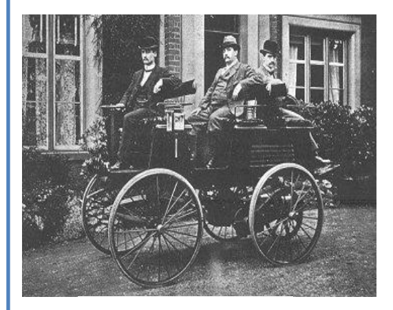
An early electric car