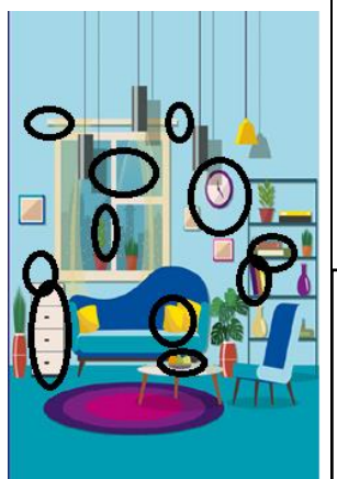
Last week's answer

Can you find the differences? There are 15 this week. Some are hard.