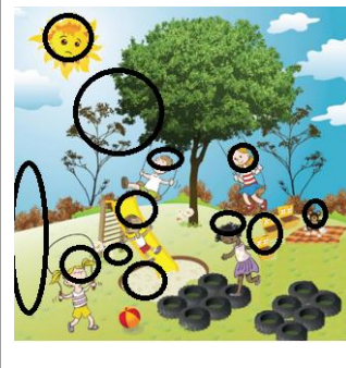
Last week's answer