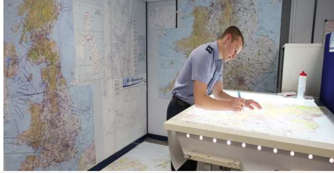
1.fit in 入れる 2.depend on ~による 3.cartographer 地図製作者 4.explore 探検する 5.indeed 本当に 6.more frequently さらに頻繁に 7.put ~ out of work~の職業の仕事を失う 8.demand 要求

This job is not so unusual, but it is probably a job you have never thought of. It is also probably a job that is changing greatly thanks to companies like Google. A cartographer<sup>3</sup> is someone who makes maps. The word comes from French. "Carte" means map and "graphie" means the science of something, as in "photography". People have made maps for thousands of years. Once we started to explore<sup>4</sup> other countries, maps became more important and once trains, planes, and cars were invented, maps became very important indeed<sup>5</sup>. Cartographers used to travel around and draw maps by hand. Modern cartographers sometimes draw by hand, but more often they use software. That is how Google is changing map making. Modern cartographers use software and photographs to make their maps. Maps are updated far more frequently<sup>6</sup> than they used to be as well. Before Google, it took a long time to update a map. These days, it is still a lot of work, but Google uses more people and their technology means that people don't have to draw the maps by hand. I thought that Google's technology would be putting cartographers out of work<sup>7</sup>, but it is the opposite<sup>8</sup>. There is more demand<sup>9</sup> for cartographers than ever before.